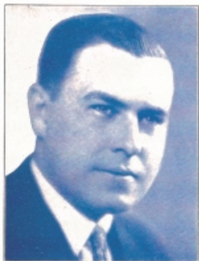
Hon. HAROLD G. HOFFMAN of New Jersey Major, U. S. A. Reserves