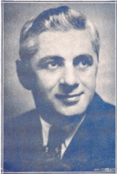
HON. MEYER ELLENSTEIN