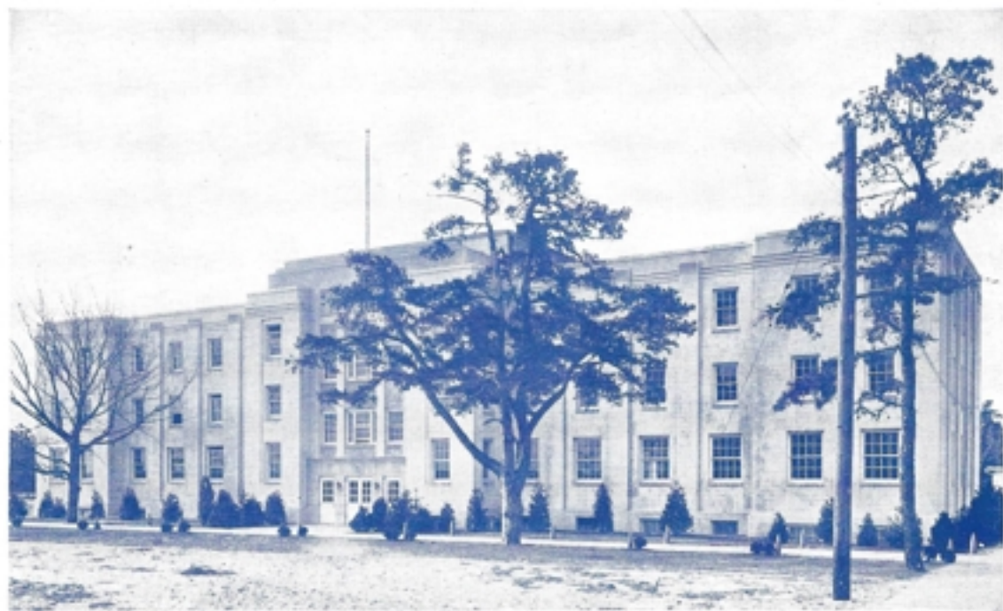
ADMIRAL DUPONT HALL