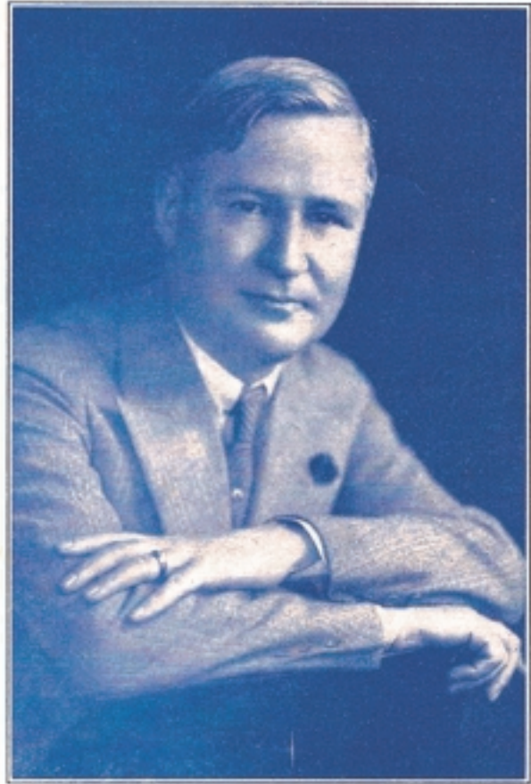
HON. A. HARRY MOORE