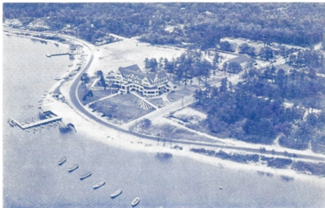
ADMIRAL FARRAGUT NAVAL ACADEMY, TOMS RIVER, N. J., AS SEEN FROM AIRPLANE