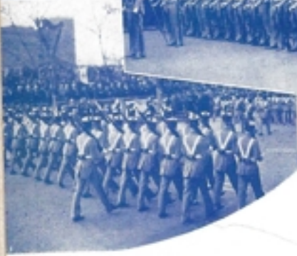
LITTLE ARMY ON PARADE