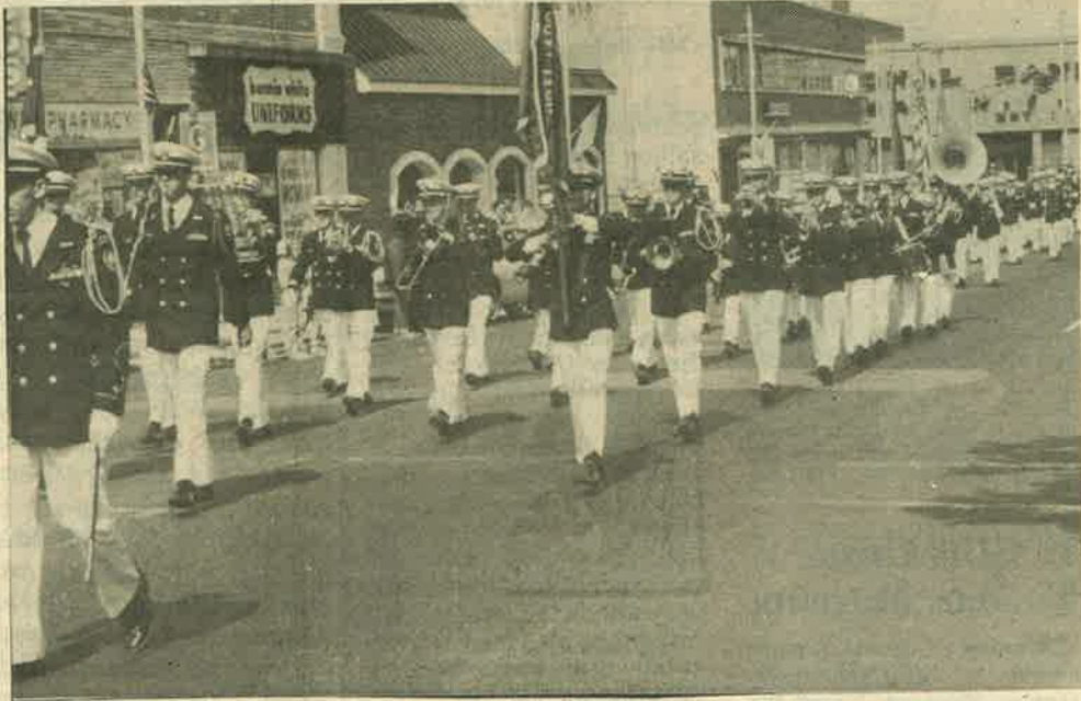
Alumni from every class back to 1934 will remember the annual participation by the Corps of Cadets in the Toms River Memorial Day parade. The Band and Corps is shown on Washington St. in the 1980 parade.