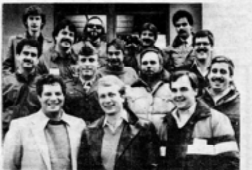
Class of '73