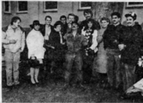
The Class of '73 relaxes at a tailgate party in the Robison Hall parking lot. They really do look relaxed!

Your picture can't appear on these pages next year unless you show up this year. It's a tradition. It's fun. It's Farragut.