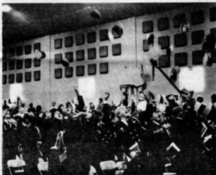
The Class of 1984 joins the Alumni Association with the traditional hat-tossing.